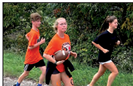
Thank you to the Cross Country team for running the Homecoming game ball from Swartz Creek to Flushing High School. What a great tradition!

opportunity for general education students to learn how to relate to people with different needs and develop an increased understanding of individual differences. Peer 2 Peer has been a class for nine years. It has improved outcomes for students with special needs and has created a more positive, accepting school culture for all.