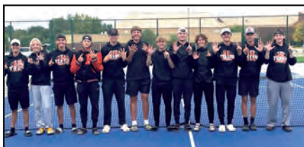
Boys Varsity Tennis won their 6th straight Flint Metro League title.