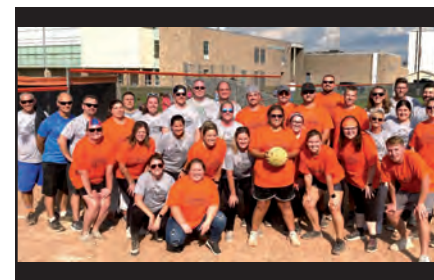
The high school staff gathered for its annual kickball game after school during Spirit Week. So thankful that everyone left the field in one piece!!