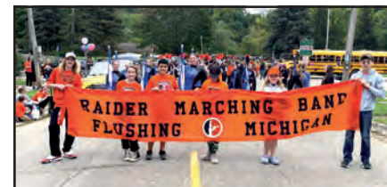
The FHS Marching Band will be heading to Ford Field on November 4 for a much anticipated competition day. We wish the band well as they head out to represent us.