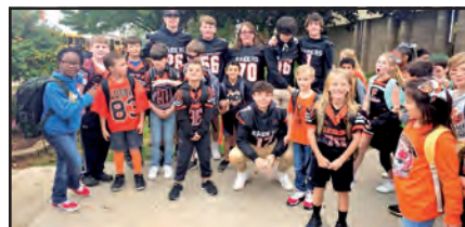
During Homecoming week, FHS Student Athletes visited the elementary buildings. The younger Raiders were so excited to receive "high fives" from the older Raiders.