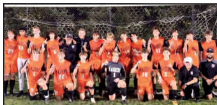
Boys Varsity Soccer won the Flint Metro League title.